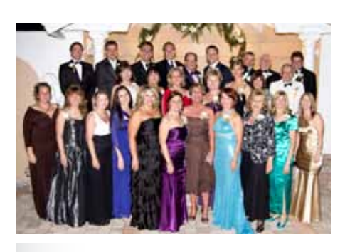
The Lighthouse congratulates all the 2012 nominees and thanks them for helping West Pasco to always be its best!